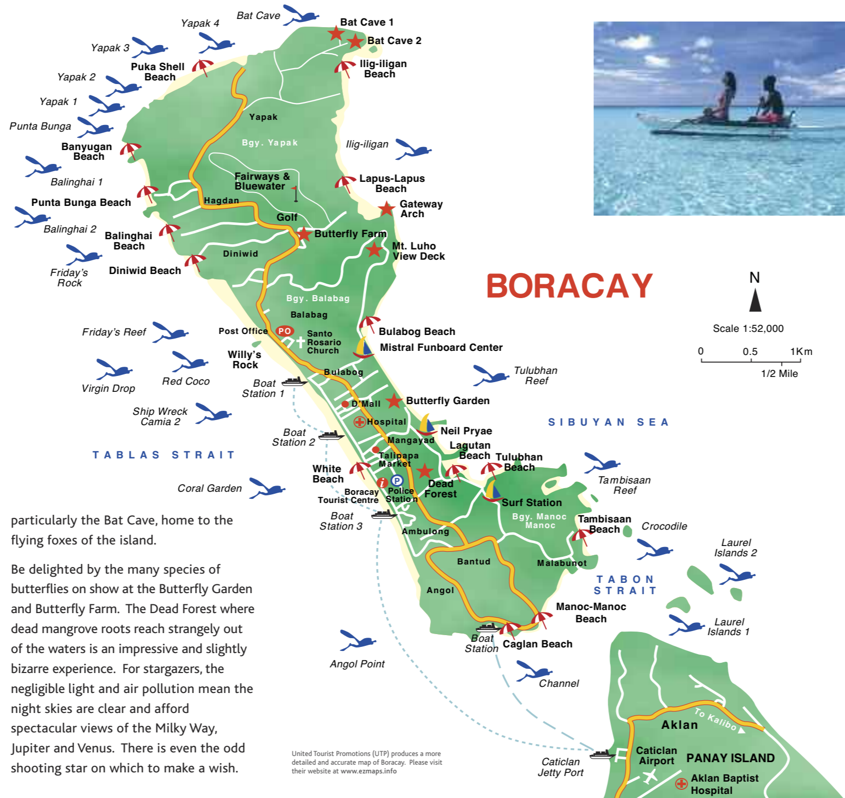
United Tourist Promotions (UTP) produces a more detailed and accurate map of Boracay. Please visit their website at www.ezmaps.info